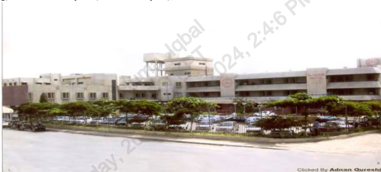
(View of KDLB Hospital)