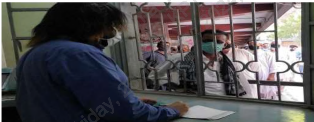
(Dock Workers getting requisition)

CARGO/CONTAINER HANDLED BY KDLB DOCK WORKERS – 2022-2023